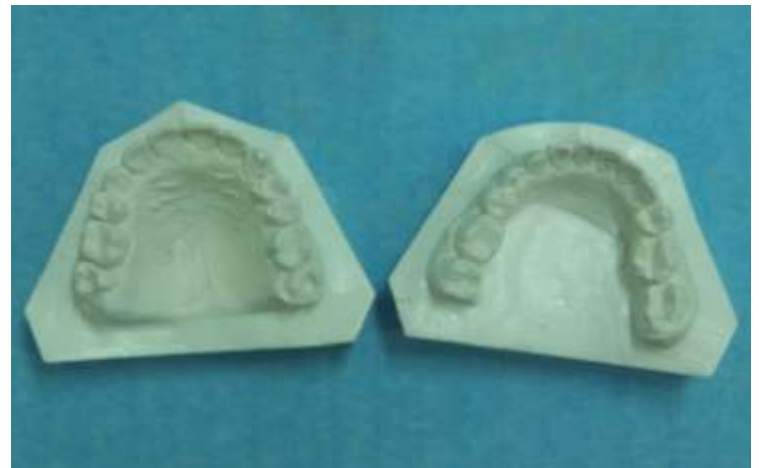
Figure3. Post treatment OPG