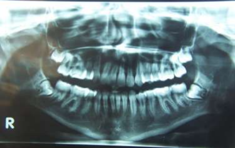
Figure 4. Post treatment OPG