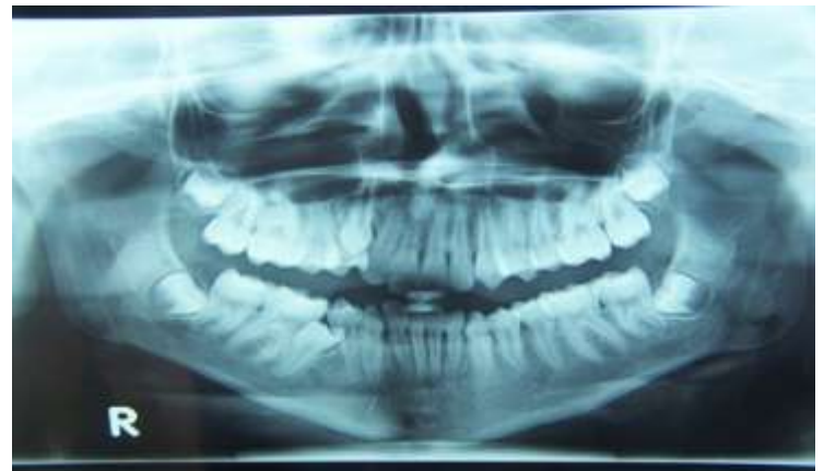
Figure2. Pre-treat OPG